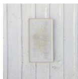
Thomas McDonell Oh my god. It Burns!, 2015