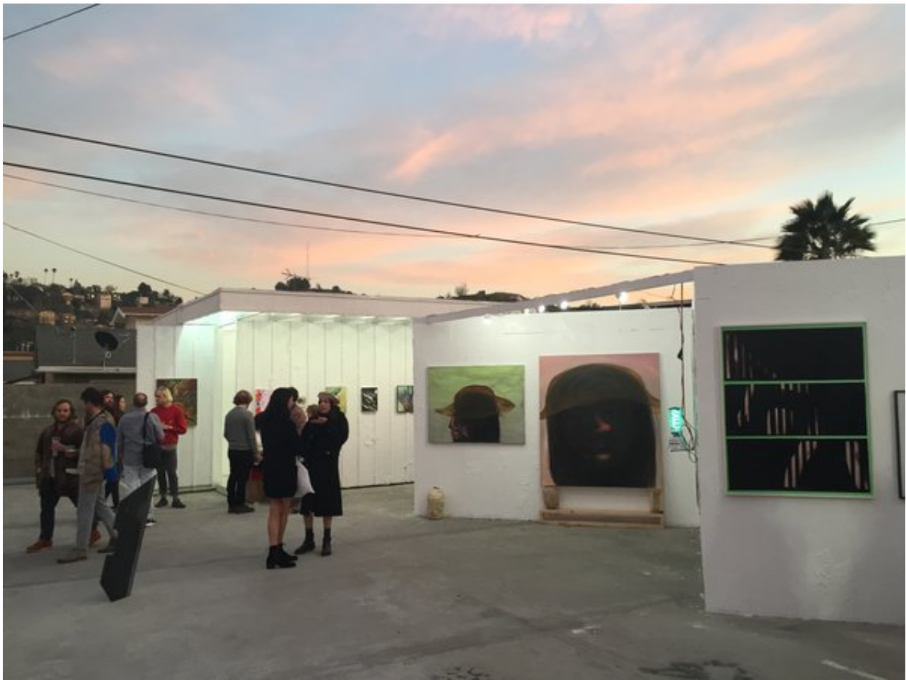
The Art Bandini fair in January