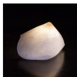
Nevine Mahmoud Tutti Laying, 2015